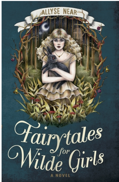
Fairytale for Wilde Girls by Allyse Near

There's a dead girl in a birdcage in the woods. That's not unusual. Isola Wilde sees a lot of things other people don't. But when the girl appears at Isola's window, her every word a threat, Isola needs help.